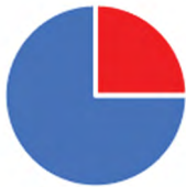
Prescribed opioids for chronic pain

We have been having quite a few good discussions in this committee regarding member health and wellness, including our industry high suicide rate. There was a conference in Denver, CO in late May that drew hundreds of leaders from the construction and healthcare industries to discuss root causes of the rise and help to prevent suicides and other health problems in our industry. Some interesting statistics from this report are that 3 in 4 injured construction works were prescribed a painkiller in 2016 and just over 1% of construction workers in the nation have an opioid use disorder, which is almost twice the national average.