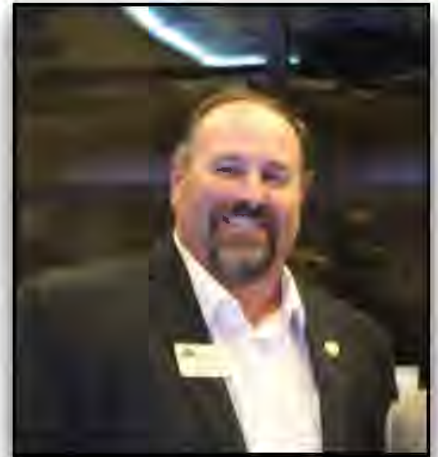
Spring Leadership Meeting Washington, DC June 13-19, 2022 BUILD PAC Report

For BUILD-PAC, our current progress in South Dakota, we have raised $42,943.32 which has surpassed our goal of $28,419.99 by $14,523.33 and South Dakota PAC is eligible for Spit back which means for every dollar over our goal we can get half back to help our State and Local PACs to make sure they can support candidates in our local and state elections that support the housing industry.