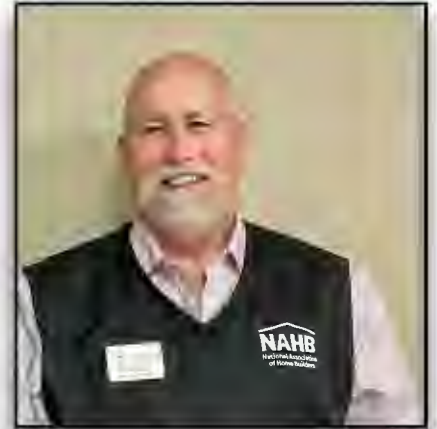
Spring Leadership Meeting Washington, DC June 13-19, 2022 State Reps Report

Looking back at the recent Spring Leadership Meeting in Washington, DC many parts of the meetings felt familiar while some things felt new. The familiar things were the Washington DC heat and humidity during the week that included the Capitol Hill visits. There were also long walks between visits as all traffic is on foot and very closely monitored. We were also warmly welcomed into our Senators' and Representative's offices during our visits. What felt new was being in DC in the spring as we have not been there since the 2019 meetings due to Covid. We stayed again at