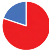
Treated for opioid use disorder