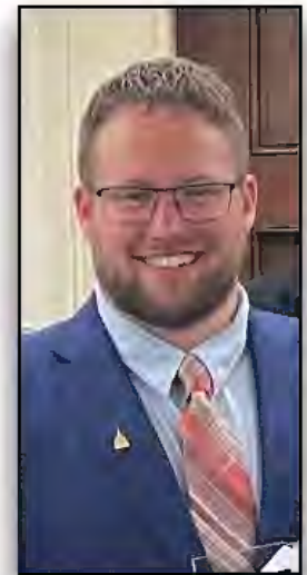
Spring Leadership Meeting Washington, DC June 13-19, 2022 National Builder Report