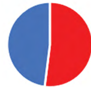
Died by opioid overdose